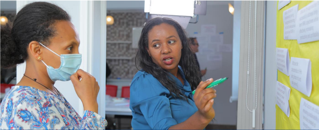
Resilience partners at the Learning Space Technical Workforce meeting identifying and prioritizing learning agenda.